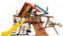
Flatpack, residential, commercial

25840 IH-10 West, Suite 1 Boerne, TX 78006 (United States) Telefon +1/210/764-13 75 Telefax +1/210/698-38 43 E-Mail alberto@rps-international.com Internet www.rainbowplay.com