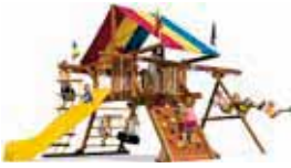
Flatpack, residential, commercial

Rainbow Play Systems Int. 25840 IH-10 West, Suite 1 Boerne, TX 78006 (United States) Telefon +1/210/764-13 75 Telefax +1/210/698-38 43 E-Mail alberto@rps-international.com Internet www.rainbowplay.com